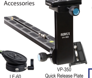
LE-60 Quick Release Plate Leveling

Handle, Quick release plate (Manfrotto compatible) instruction manual, warranty card