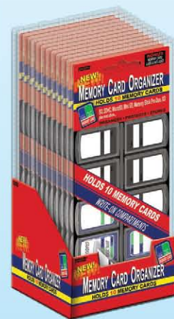
Counter Display / 12 ea.