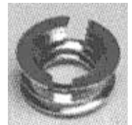
BSA401 Pk/10, Camera Bushings

Reduces 3/8" tripod thread on camera to 1/4 - 20 tripod thread.