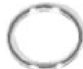
BSA961 D-Ring, Round, card/6 pair