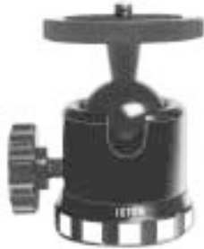
BST285 Medium Ball Head TCB-8V

Height: 4" Top Plate: 3" Diameter, Base: 1 3/4" Diameter Ball: 1 1/2" Diameter Screw: 3/8" (top), 3/8" (bottom) Weight: 585 gram (1.3 lbs.) Maximum Camera weight: 16 lbs.