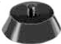
BST327 Tripod Adapter for TCB-4/BH-4 AD-4

Height: 3/4" Top Platform: 1 1/2" Diameter, Base: 2" Diameter Bushing: 3/8" (top) Screw: 3/8" (bottom) Weight: 85 gram (3oz)