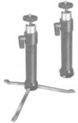
BSA575 Snap-Set Grip-Pod

Use as a table-top tripod, camera grip or chest pod. Legs store internally and snap open automatically. Ball & socket head with finger-tip lock. Comfortable 6 1/2" hand grip. Non-skid feet for stability and safety. Height 7 1/2", leg spread 8", weight 7oz. Samigon blister. Master: 10.